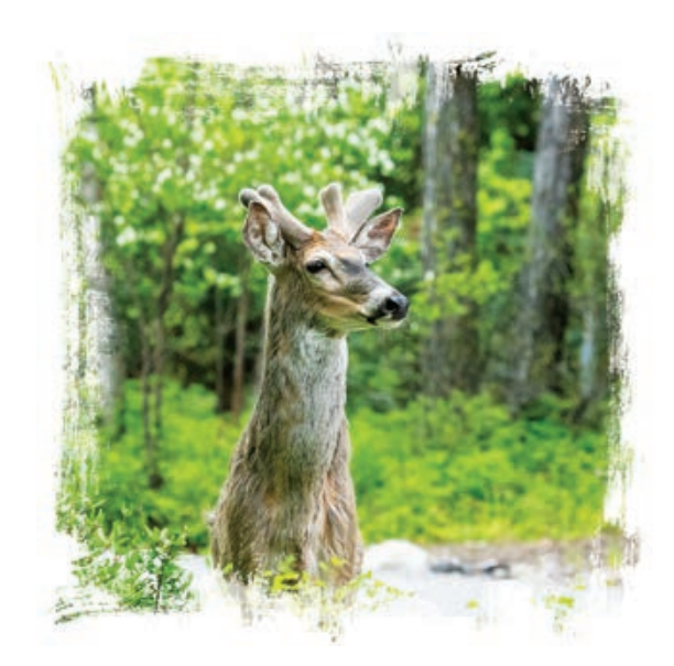
A white-tailed deer stands alert in the city of Whitefish, Montana.

To help achieve its solar goals, Whitefish began working in the summer of 2017 to get its <u>SolSmart</u><sup>5</sup> Bronze designation. SolSmart is led by The Solar Foundation and funded by the U.S. Department of Energy Solar Energy Technologies Office. As part of the SolSmart Program, Whitefish receives support from the National Renewable Energy Laboratory at no cost.