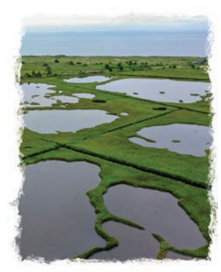
An aerial view of coastal marshes in Cape Cod. Coastal marshes are gaining recognition for the role they play in burying carbon and mitigating climate change.

These pilot projects are still in the early stages of conception. But RAE has been working hard to support the acceptance of wetlands in the broader, voluntary carbon market in other ways. For example, the organization helped develop a standard methodology for quantifying greenhouse gas fluxes between wetlands and the atmosphere. These fluxes can vary greatly from one site to another, making it very labor-intensive to get specific estimates for each wetland. In 2011, RAE led a technical working group to develop a standard methodology for calculating methane emissions for wetlands. The group then reached out to Verra, an environmental organization. Verra's Verified Carbon Standard (VCS) Program is the most widely used voluntary carbon market program in the world. By 2012, the methodology for wetlands that RAE developed was formally accepted by the VCS program.